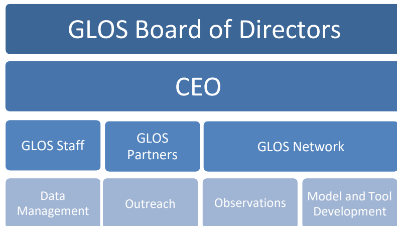
Figure 2: GLOS Organizational Chart