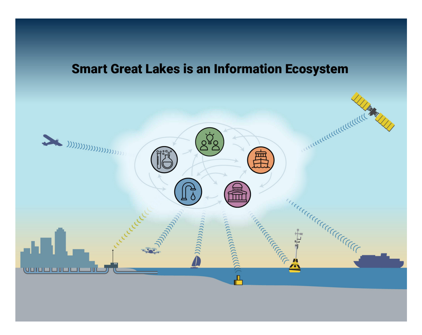
Figure 2: The Smart Great Lakes information ecosystem includes many components. Science, research, water treatment facilities, observation instruments, all levels of government, industry, innovative ideas and people are only the beginning of what is possible.

The SGLi aims to facilitate coordination between data providers and data consumers, and to streamline the transformation of information into accessible and timely insight for rights holders and stakeholders across the watershed including policymakers, business leaders, infrastructure operators, water quality managers, and the public. Over the course of the next five years, the SGLi will follow the steps laid out in the timeline.